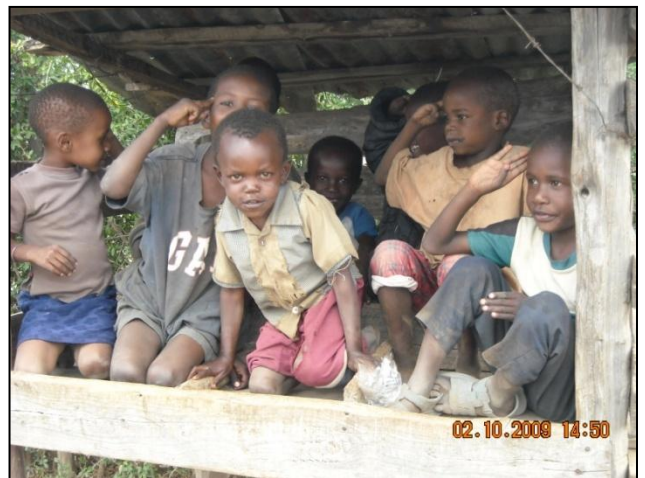
Children in Kenya