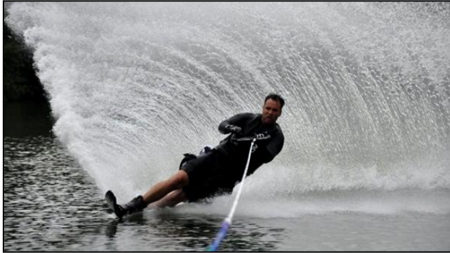
Out for an Early Morning Ski

Soon Gerri had me completely hooked again. My wife began to see signs of my obsession start to pop up