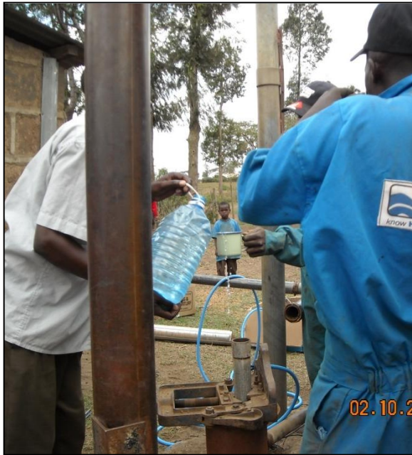
Child Waits for Water from the Fixed Borehole

For many of us, water is a limitless source of recreation and yet for many others, its scarcity impacts every facet of life. This is especially true in Kenya. Since the borehole has been fixed, schools have been able to reopen and the sick have been able to get water again. Livestock have been able to rehydrate and provide good milk and food and crops can be watered.