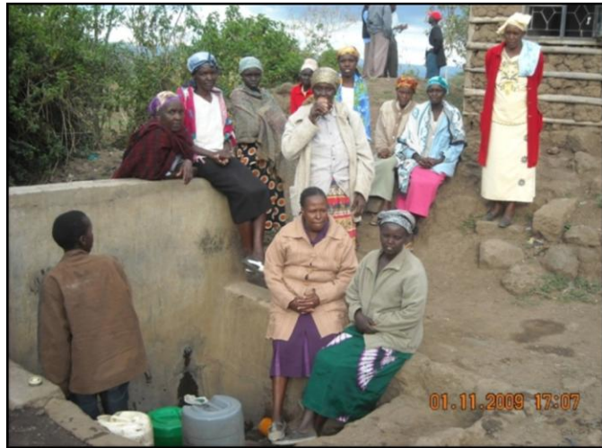
Community Members Gather at the Borehole